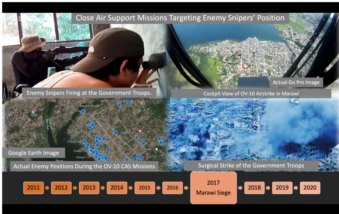
Figure 5. Close air support (CAS) missions during the Battle of Marawi (Map Data © 2023 Google).

and reconnaissance (ISR) support provided by the Royal Australian Air Force enhanced the air intelligence capability (Agence France-Press, 2017).