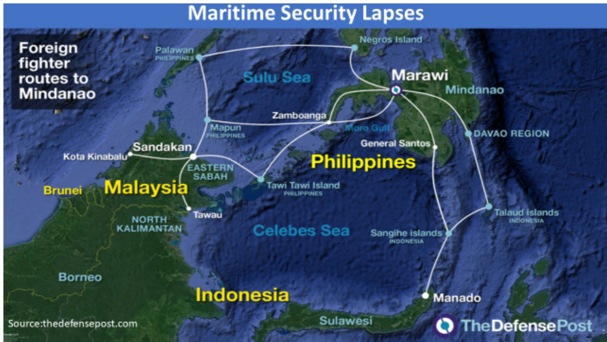
Figure 6. Foreign fighter routes to Mindanao (Yusa, 2018).

dle East, North Africa and South Asia. There is an ongoing stalemate between the AFP and the ASG-IS in Patikul, Sulu. However, despite the limited movement imposed by the government in connection with COVID-19 protocols, the ASG-IS faction continues its recruitment efforts (Yaoren & Ramah, 2020).