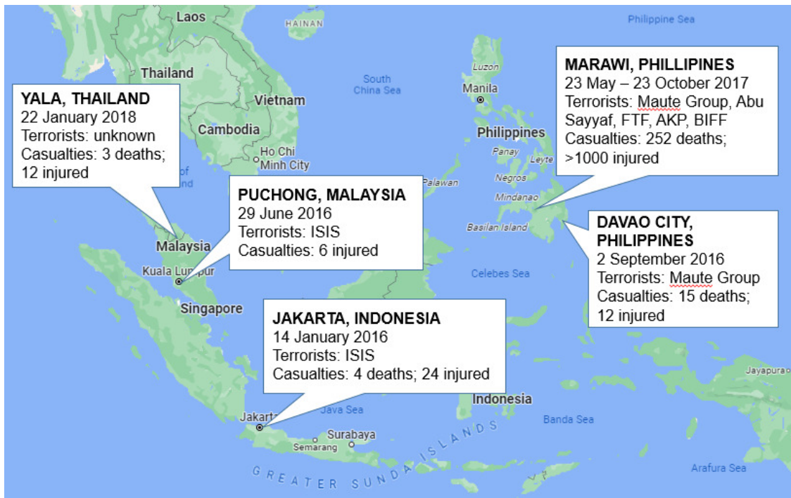
Figure 2. Terrorist incidents in South-East Asia (2016–2018) (Map Data © 2023 Google).